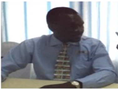
Hon. Peter Duku Wani: MP for Kator and Rajaf Payam.

and referendum) laws, and policies. A constitution is an agreement between the people and the state. The permanent constitution has been drawn from the current constitution with clear roles in legislative, executive and judiciary. A person should be only in one of these arms of government. The government is currently adopting the decentralized system of government but most of the citizen prefer federal system. But we are still gathering more information from the grassroots which system will be better from the three (federal, central or decentralized) the public opinion will be brought to conference committee. All citizens of South Sudan are to participate fully in this process of formulating a permanent constitution.