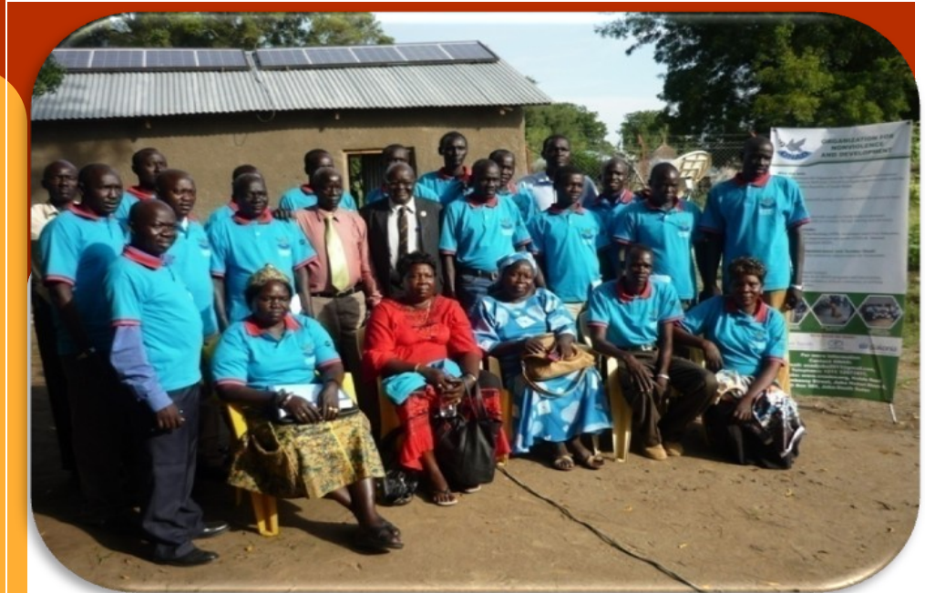
Community Representatives, MPs and Local Gov't officials in Terekaka